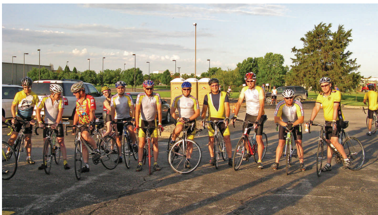
Prairie Village Yacht Club riders at Lone Star ride start.

Thanks to all the riders who rode the Lone Star and to the volunteers who worked so hard to make this ride great. If you know someone who volunteered for the Lone Star, thank them for a great job. It's not easy to recruit volunteers for these rides, and many of this year's volunteers are cyclists who will want to ride next year. If you didn't volunteer this year please do in the future. The JCBC needs all the help we can get planning and running our events.