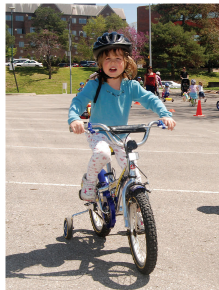
She wears a helmet—and so should you.

Some of these "invincible" young adults are going to pay a very steep price for this stupid fashion statement. Hopefully, riding sans helmet will be a short-lived trend. In the meantime, I would challenge cyclists to not cave in to this apparent fashion trend, and to help educate young people and new riders about the importance of wearing helmets. Make cycling a safe activity. Wear a lid.