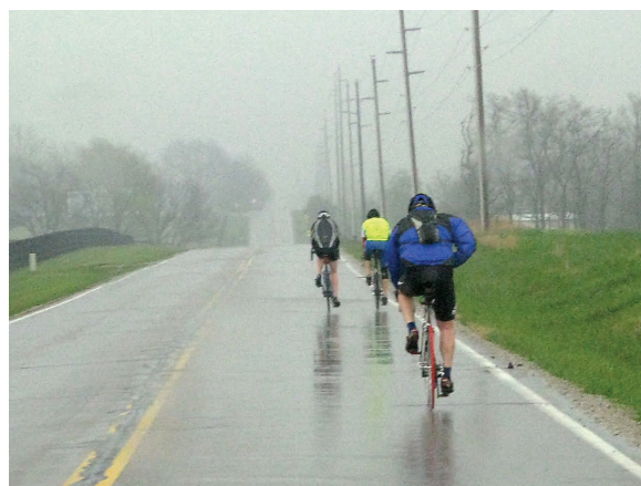
Spring Classic riders defining dedication to their sport.

A lot of work goes into these rides, even ones like the Spring Classic, which was run much like it has been in years past. Permits have to be obtained from some of the municipalities on the route. The route itself has to be planned, and construction projects can cause major complications in the route planning. Permission has to be obtained to use the SAG locations. Volunteers have to be recruited. The ride has to be promoted. Flyers, route maps and registration forms must be printed. As the ride day draws near, the route has to be painted, and supplies purchased. The logistics of the running of the event must be planned out. On ride day, the equipment is hauled out of storage, transported, and set-up. After the ride, everything must be cleaned and packed back away.