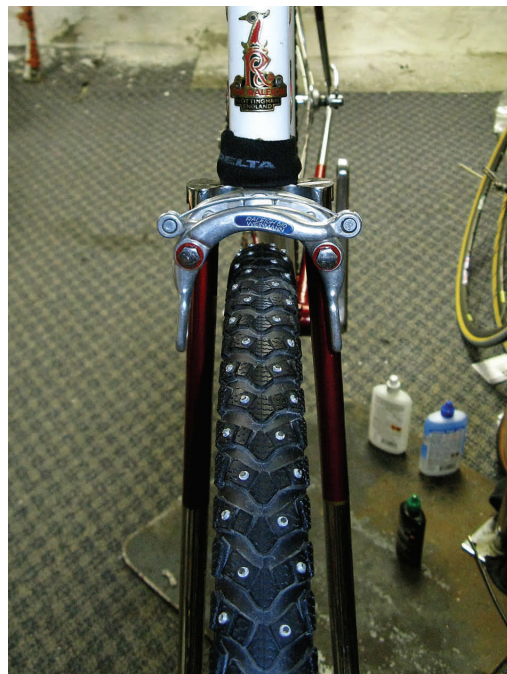
The Schwalbe Marathon Winter tires have studs in the center and on the edges, 240 in all.

I purchased a pair of 700X35C Schwalbe Marathon Winter tires, which sport 240 carbide studs each, and put them on my commuter bike, a 1984 Schwinn LeTour that I bought when I was in high school. They are amazing on ice! I rode up my street in Kansas City, MO, which was covered with ice, and came to a smart stop at the intersection. I could lean, turn, accelerate, and stop on the ice-covered street. I have not pushed the tires to their limits (and don't care to), but I quickly became confident in their ability to keep me upright with normal riding. A ride to work on mostly clean streets with the studded tires introduced another of their characteristics: big, ugly rolling resistance. I obviously didn't want to be riding these things when I didn't need them.