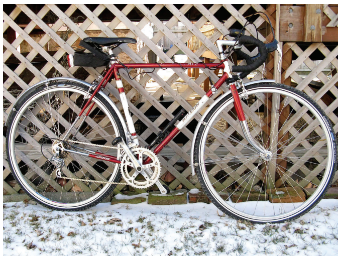
1976 Raleigh Super Course Mk II with studded tires and fenders.

I looked through my inventory of parts and found 1980's vintage sealed bearing hubs (perfect for sloppy weather), a saddle, the original Sugino crankset and Dia Compe brake levers from my Schwinn, an appropriate bottom bracket, a six-speed 13X28 Suntour freewheel, an extra set of Speedplay Frog pedals, and a set of handlebars. Over the period of a few weeks, I found and purchased on eBay, a set of Suntour downtube Power Ratchet shifters, a Suntour Sprint rear derailleur, and a Suntour Mount Tech front derailleur, all 1980's vintage new old stock, and all components that I knew worked very well. I also purchased a pair of Richey Rock Comp rims (2 for $30), a little heavy, but well made and strong, spokes, a used stem I found at ACME in Kansas City (a great local source of used and vintage parts), a SRAM 8 speed chain, a set of full-length fenders, and new straddle cables for the stock Weinmann center pull brakes. The headset on the Raleigh has proprietary threading and is obsolete, so I'm stuck with it, at least the top half. Fortunately, it's a heavy chunk of steel and should last a long time.